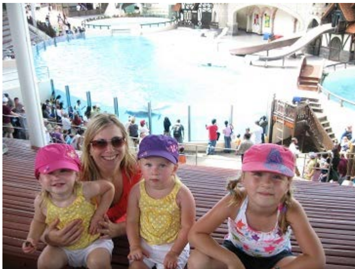
The Burden Family are the first to use our NEW Marineland Discount.

Summer Discounts Update - Some discount codes for Summer Attractions 2013 have been confirmed and are now posted in the Member Section of the MBC website. As additional discounts are confirmed the list will be updated.